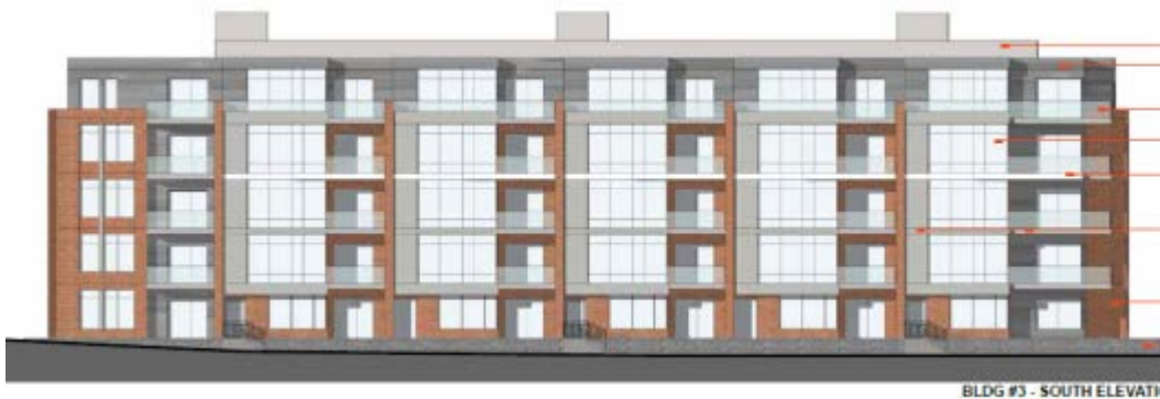
BLDG #3 - SOUTH ELEVATION