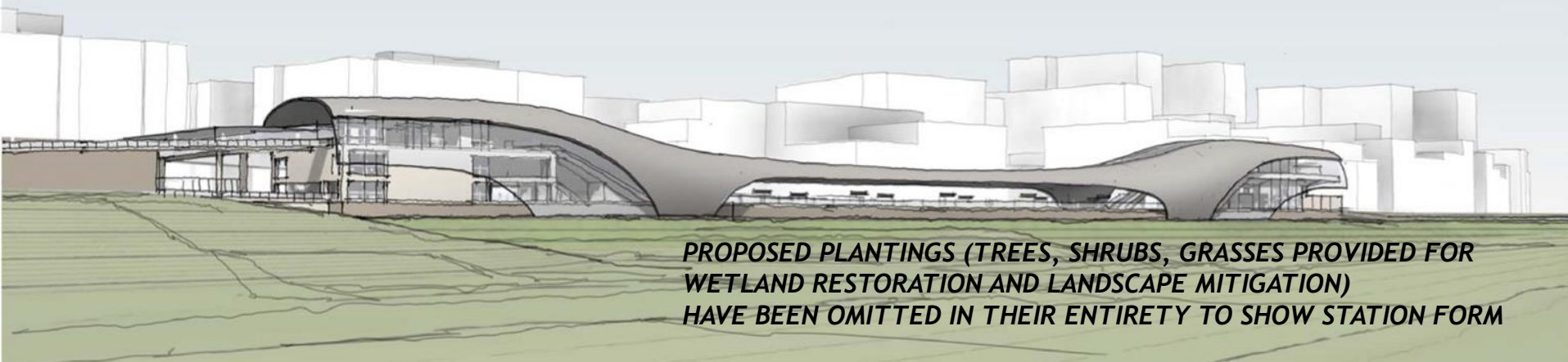
RENDERED VIEW LOOKING NORTHWEST