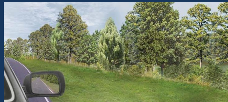
POTENTIAL VIEW FROM SOUTHBOUND PARKWAY LOOKING SOUTHWEST - 10 YEARS GROWTH OF NEW PLANTS (SUMMER)