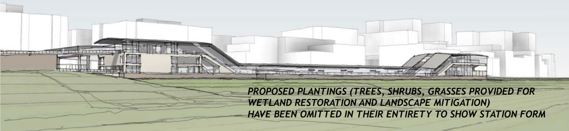
RENDERED VIEW LOOKING NORTHWEST

PROPOSED PLANTINGS (TREES, SHRUBS, GRASSES PROVIDED FOR WETLAND RESTORATION AND LANDSCAPE MITIGATION) HAVE BEEN OMITTED IN THEIR ENTIRETY TO SHOW STATION FORM