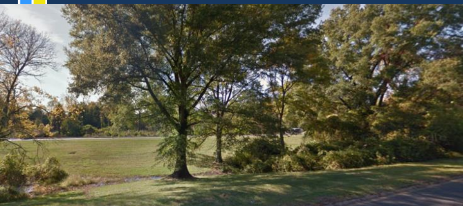
EXISTING VIEW FROM PARKWAY LOOKING NORTHWEST