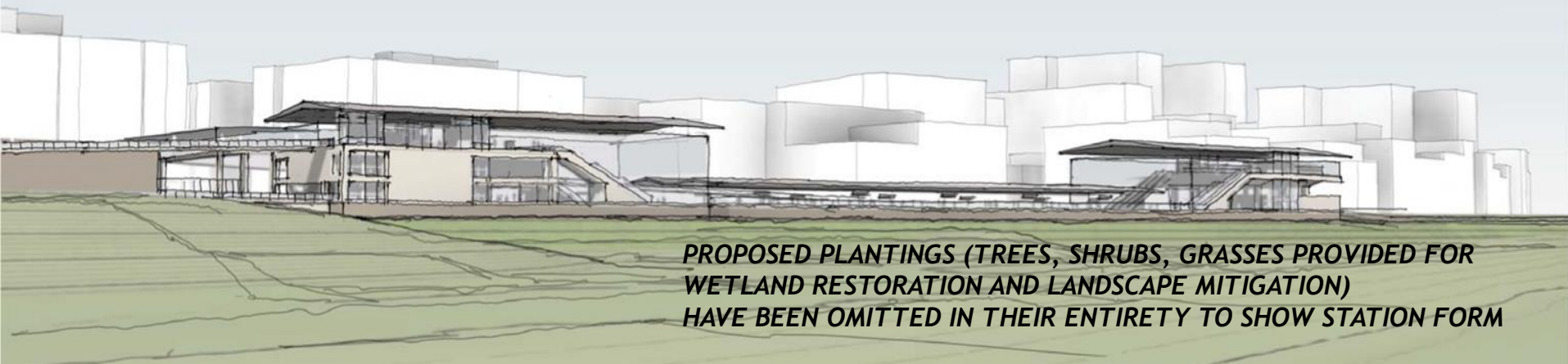
RENDERED VIEW LOOKING NORTHWEST