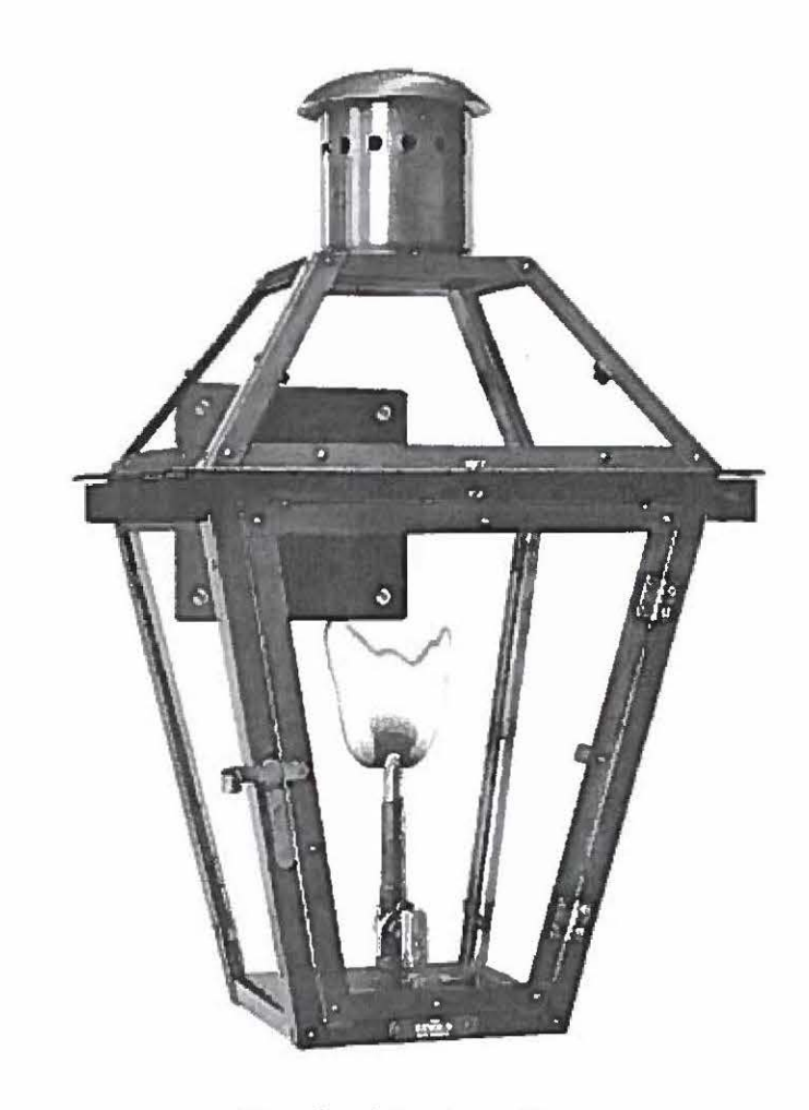
Standard Lantern Sizes