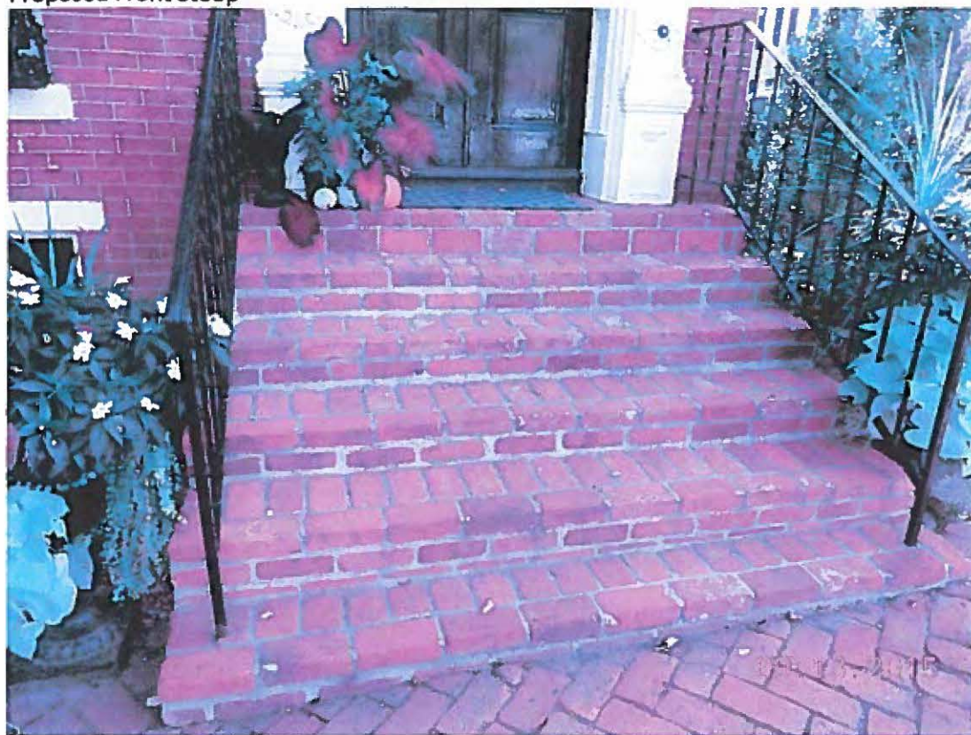
Proposed Front Stoop