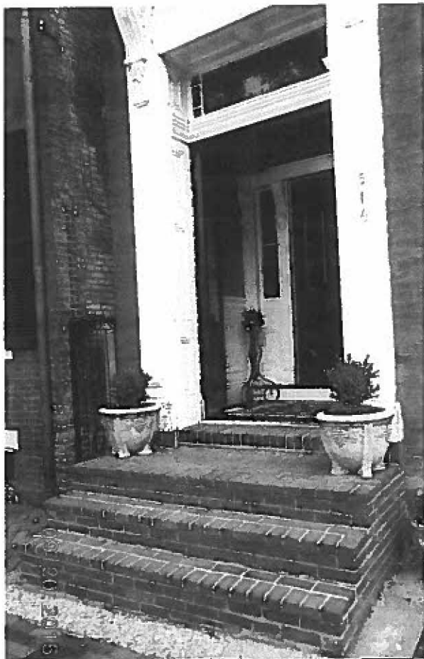
516 Cameron Street Existing Front Stoop