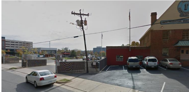
View from Wheeler Avenue