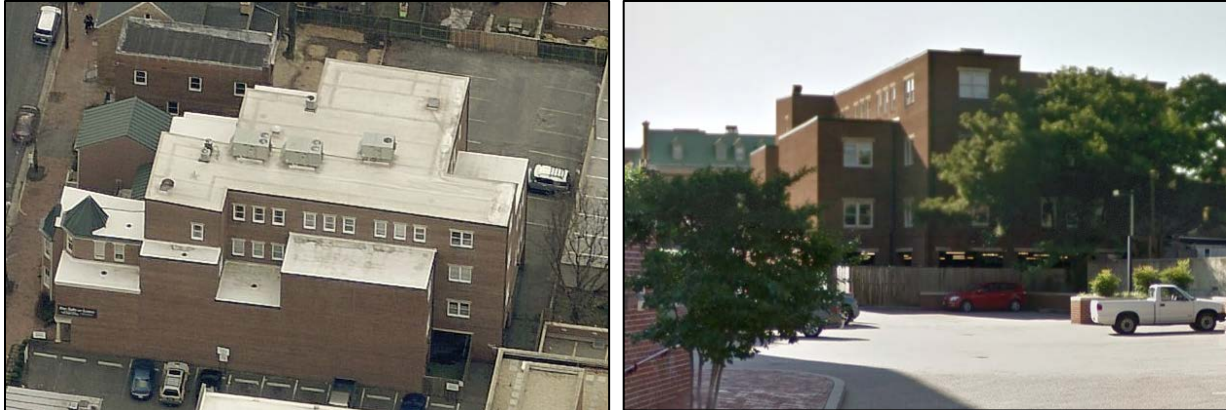
Figure 2: Aerial showing available rooftop space to relocate units so that they are less visible (left image) and visibility of existing units from Prince Street, looking east (right image).

The zoning ordinance requires that all rooftop mechanical equipment in the city be screened. The BAR's Design Guidelines further state that, to the extent possible, mechanical equipment should be hidden from view and integrated with the overall building design. Although the Design Guidelines recommend that visually prominent HVAC equipment be screened and painted in a way so that it does not detract from the building, the BAR does have the authority to grant a waiver of rooftop screening, should it find the screening to be more visually obtrusive than the unit itself, per §6-403(B)(3) of the zoning ordinance.