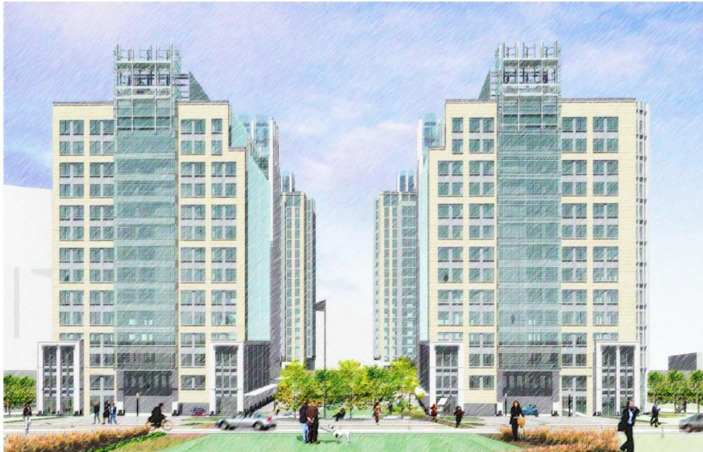
4 VIEW FROM THE CAPITAL BELTWAY LOOKING NORTH SCALE: N.T.S.