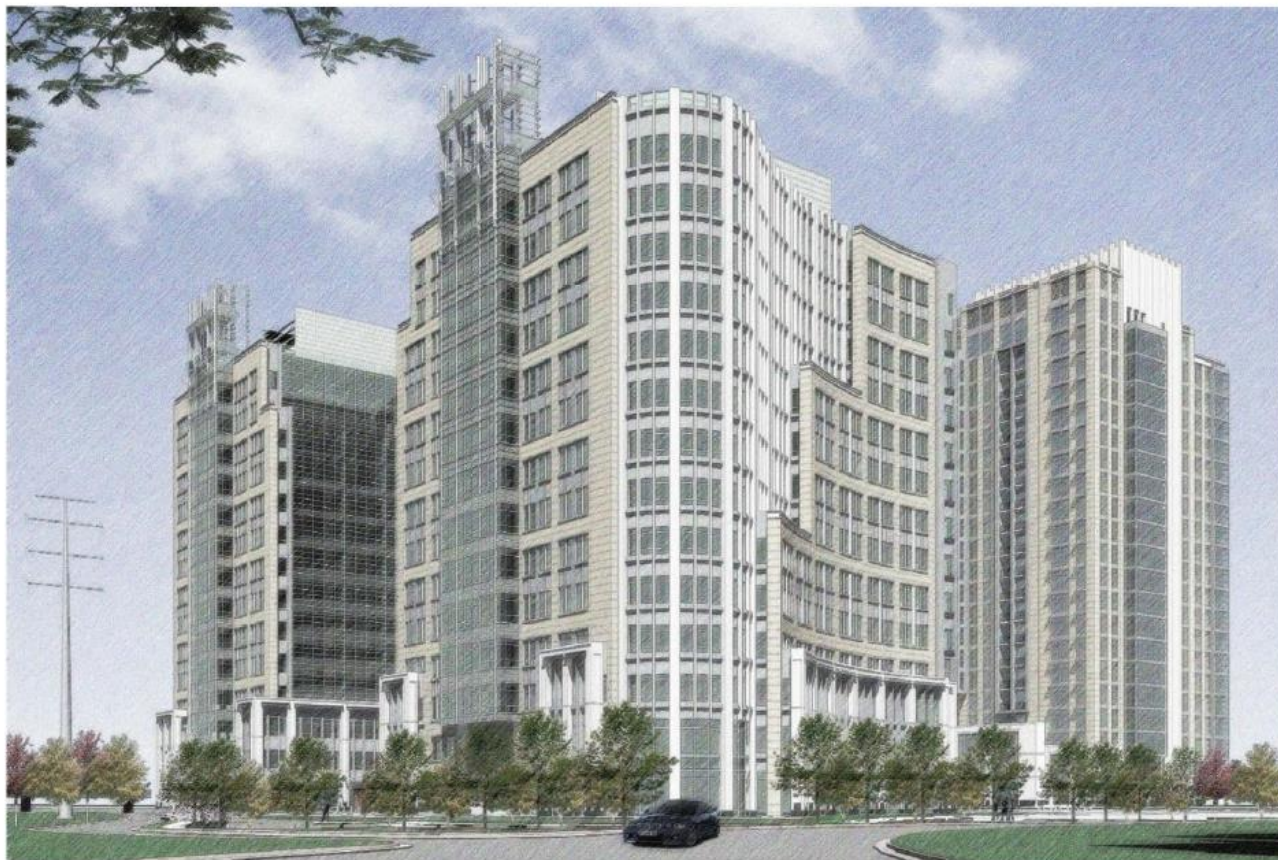
3 VIEW FROM THE MILL ROAD RAMP SCALE: N.T.S.