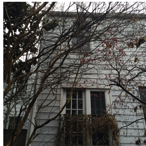
1118 Rear Elevation