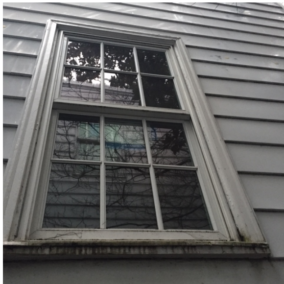
1118 Present Window