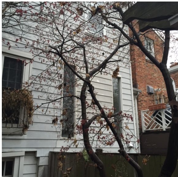
Immediate Neighbor Windows