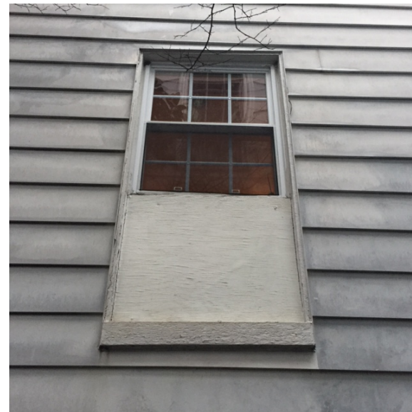
Neighbor's Window Reduction