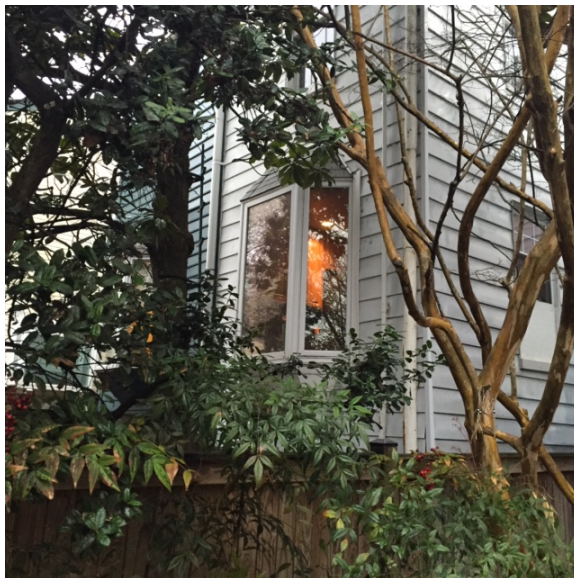
Immediate Neighbor Windows