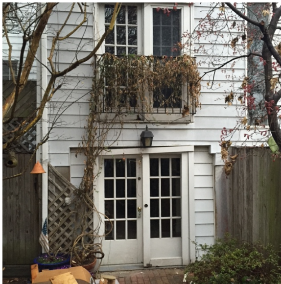
1118 Rear Elevation