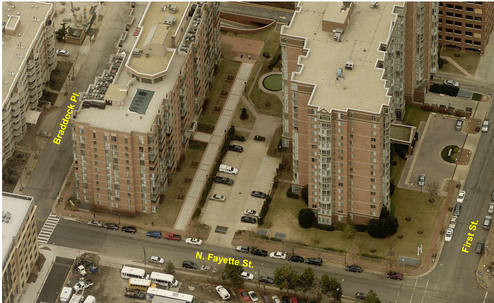
View of the Site looking West