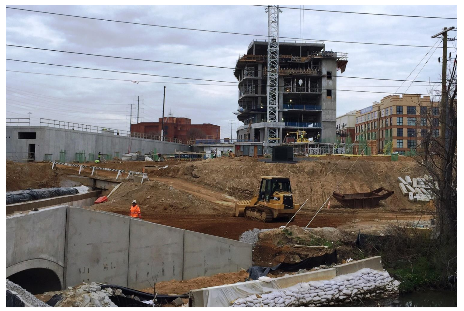
View from main parking lot