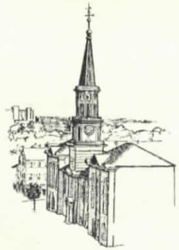
City Hall Alexandria, Virginia