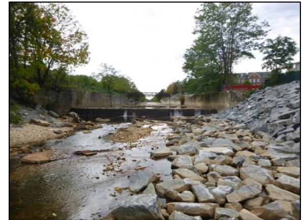
Backlick Run flume