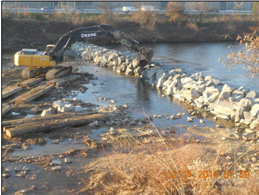
Placement of rip-rap