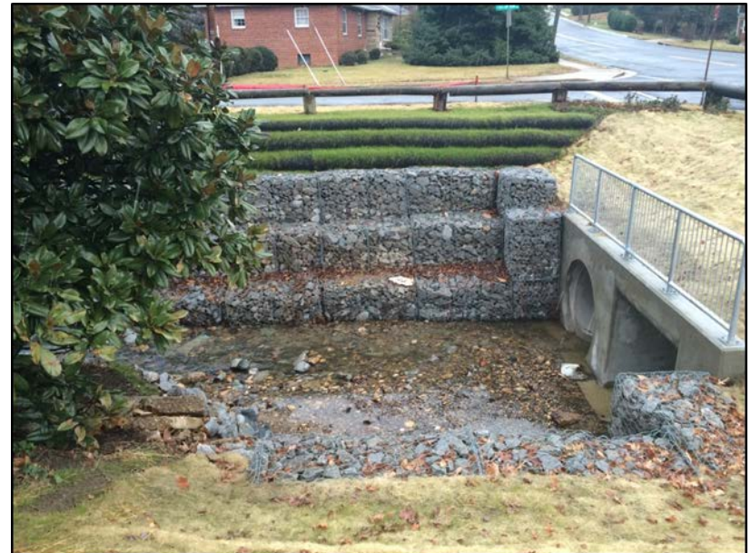
Newly constructed headwalls and channel improvements