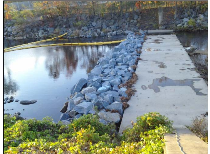
Completed rip-rap placement below weir