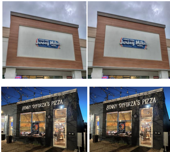
Figure 3: Examples comparing wall sign increase. Left image shows existing 1:1 ratio, right image represents signage with 1:5 ratio

Based on the foregoing, staff recommends an increase in wall sign allowance from 1:1 to 1:1.5.