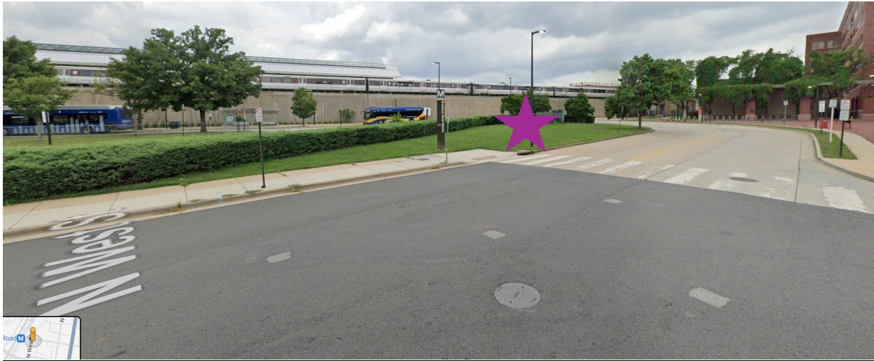
Street View showing potential locations