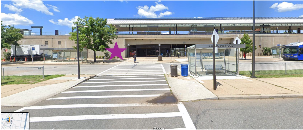
Street View showing potential locations