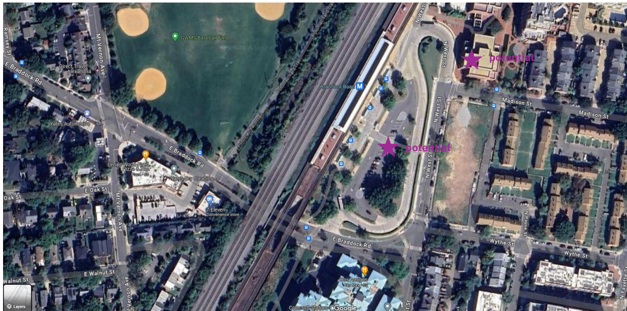
Aerial map of Braddock Road Metro showing potential locations