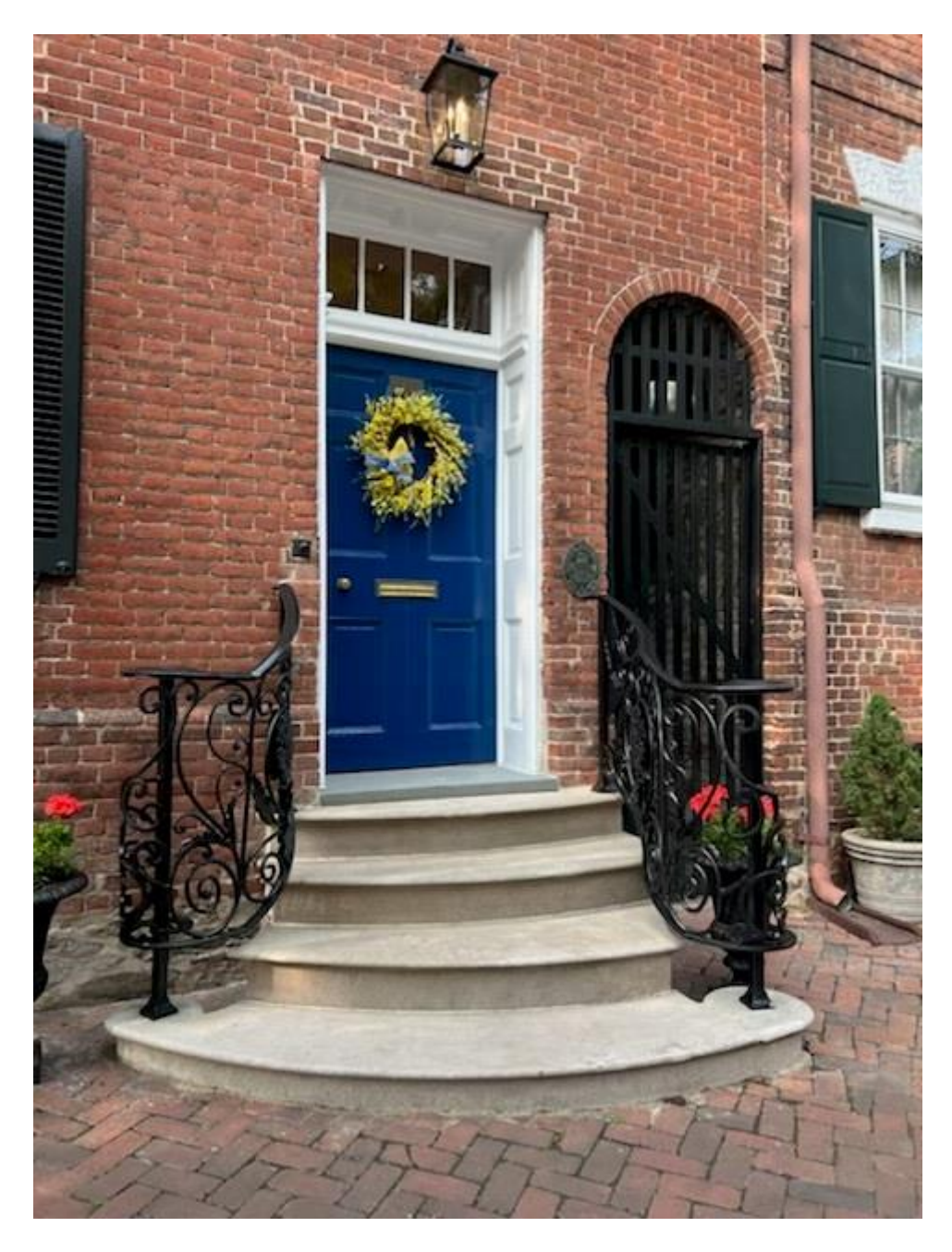
Front view from closer point