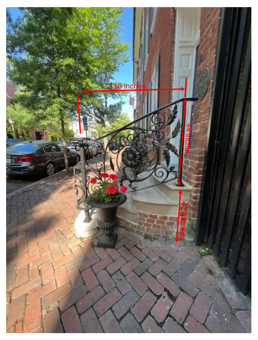
Side view with dimensions