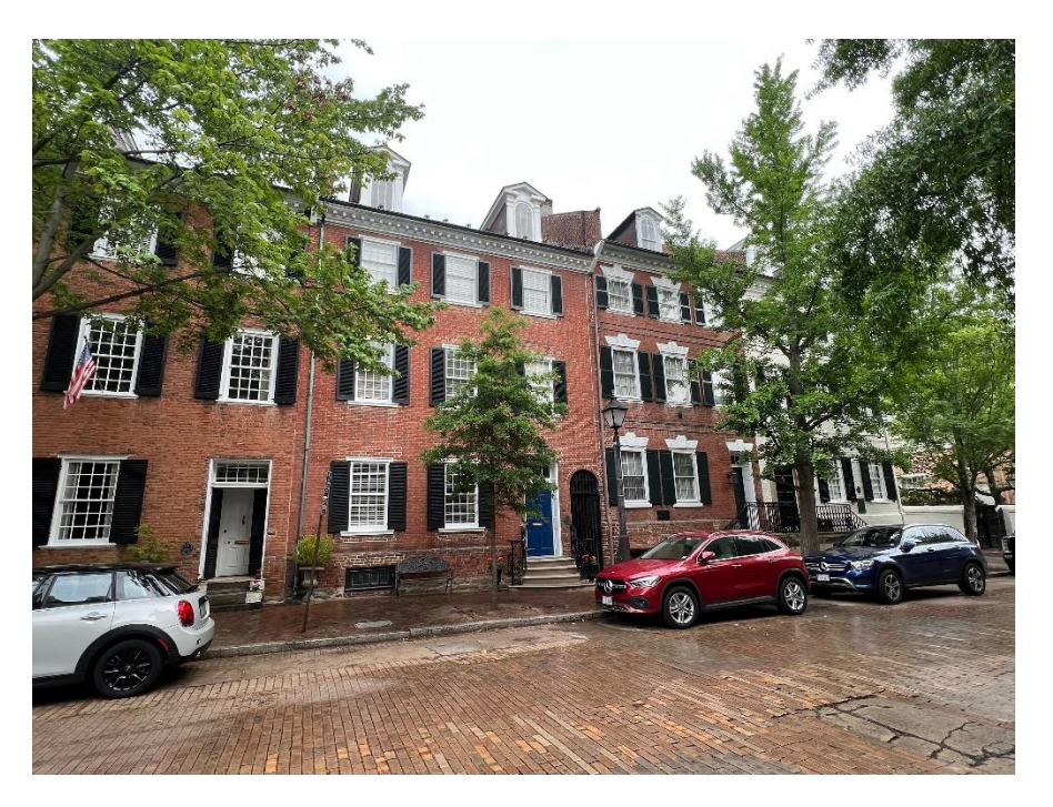
Street view of 211 Prince Street with new handrails on existing steps