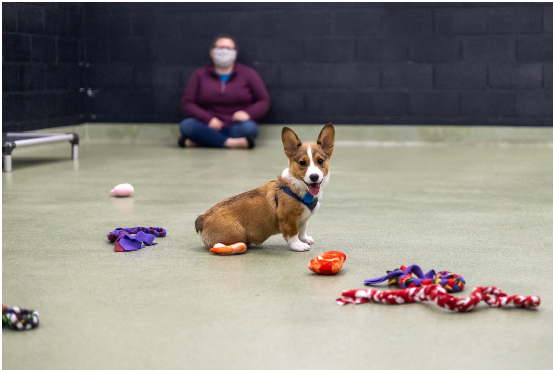
Theo having a blast at the Board Hound during a puppy party session.

I've made use of the Board Hound's full suite of services, from regularly attending puppy parties when my corgi Theo was 12-16 weeks old, to enrolling us in all the group training classes and taking him to daycare on a regular basis. Based on my interactions with staff and use of the facility, I'm confident it would be an ideal location for overnight boarding services, something that Old Town desperately needs.