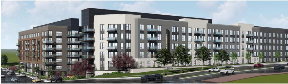
View from Mark Center Avenue