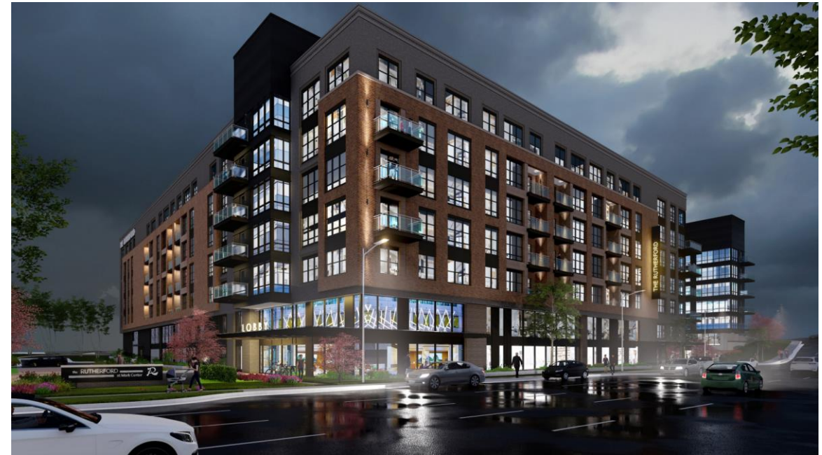
Night view from Mark Center Drive