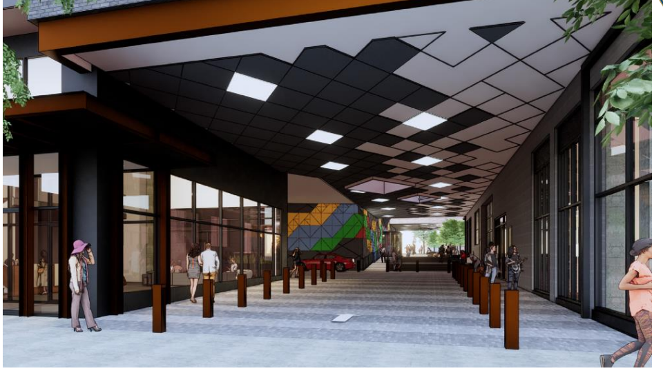
Paseo entrance from Madison Street