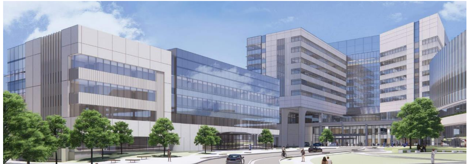
Looking west on Westend Blvd./Road 1 with SCC left, hospital middle, and cancer center right