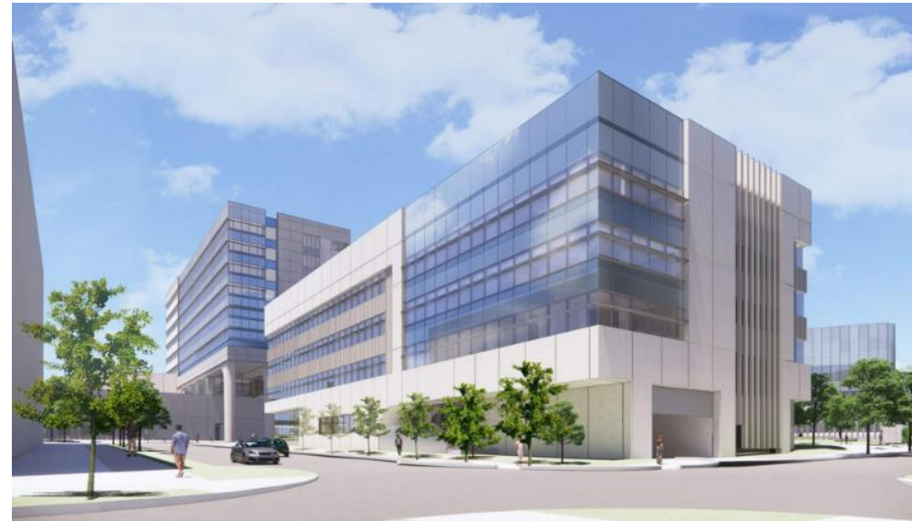
At the intersection of Hecht Ave and Tucker St. with the SCC in front