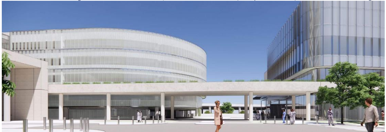
Looking north on Healthway Pl./Road 3 with garage on left and cancer center on right