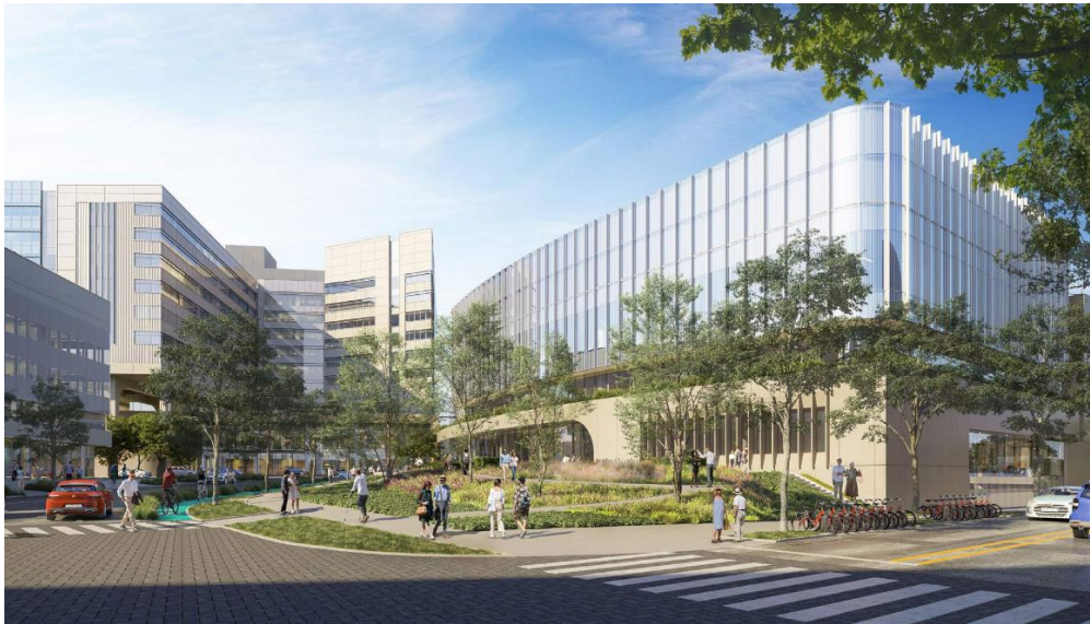
Looking East on Westend Blvd. with Block Q in front