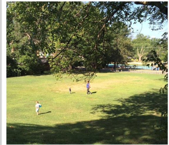
City of Alexandria Neighborhood Parks Improvement Plan