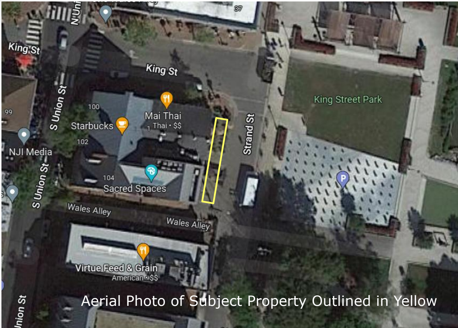
Aerial Photo of Subject Property Outlined in Yellow