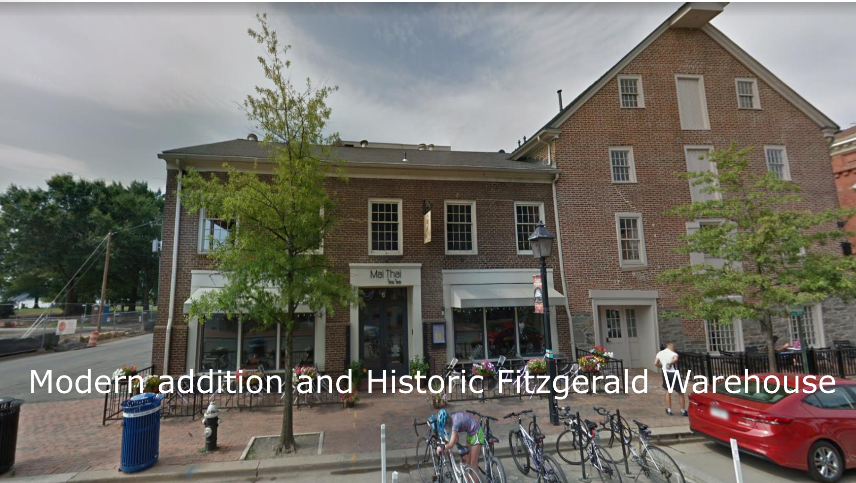
Modern addition and Historic Fitzgerald Warehouse