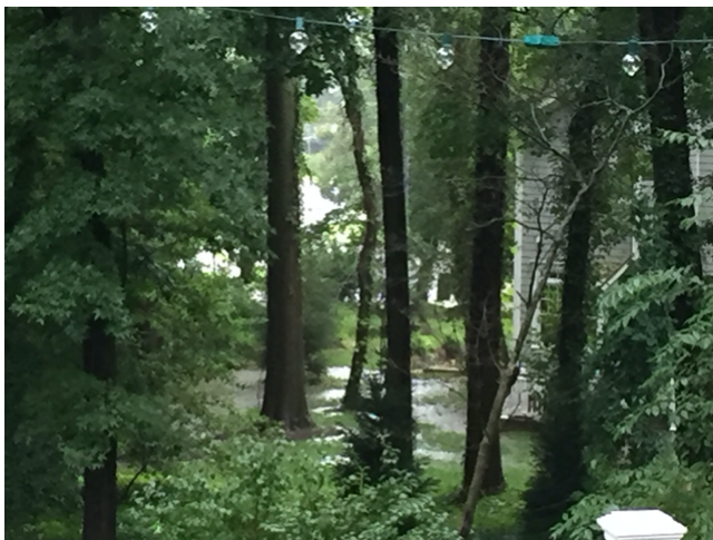
#1 August 2, 2018