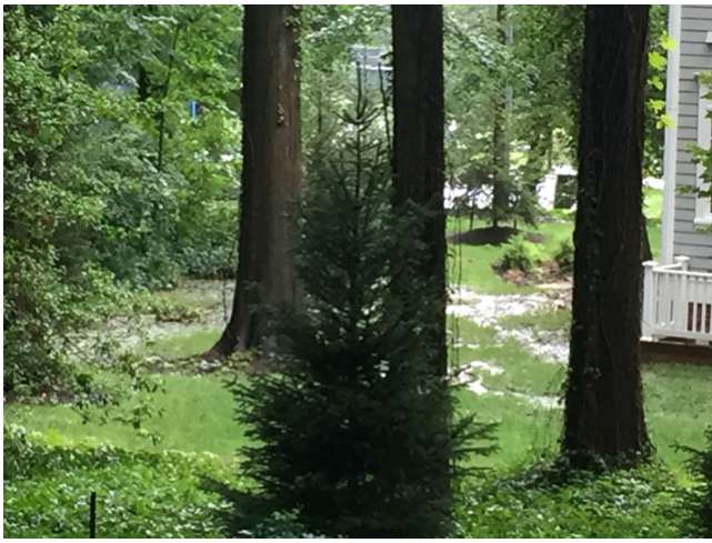
#2 August 2, 2018