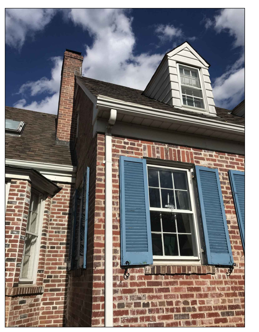
1940 original gable dormer