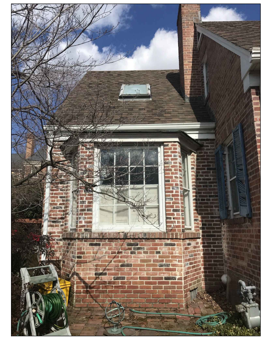
1977 addition front elevation