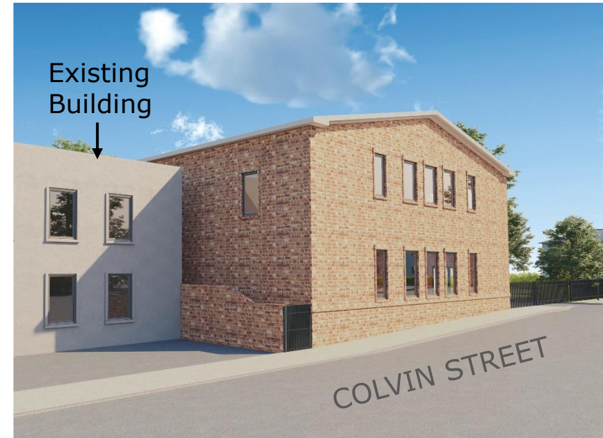
View of north and east building façade from Colvin Street.