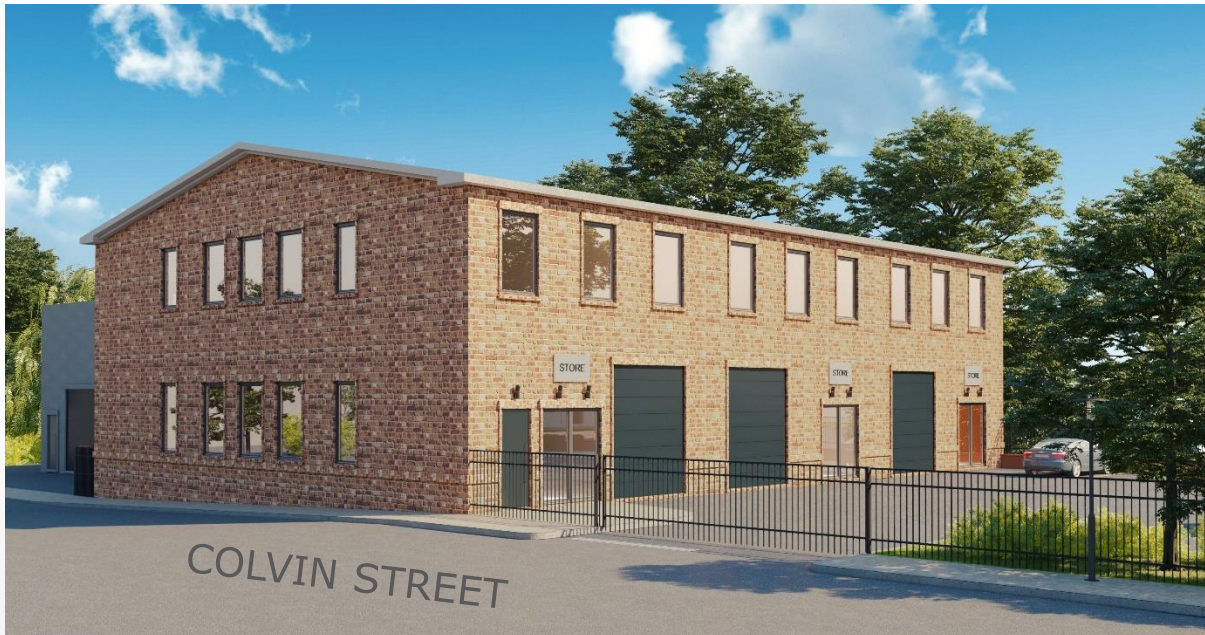
View of north and west building façade from Colvin Street.