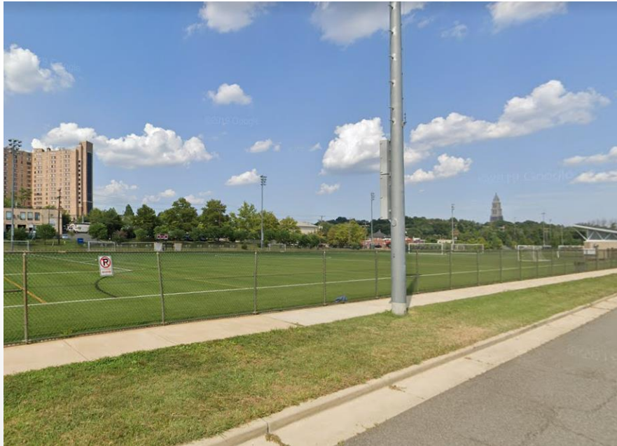
Existing Athletic Fields

Planning Commission and Staff recommend approval of the SUP request.