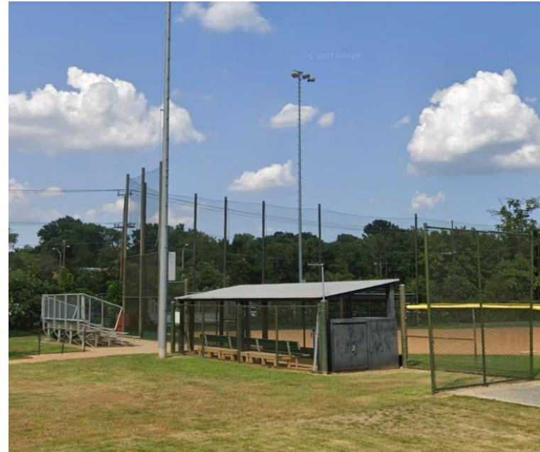
Existing Softball Field with Netting