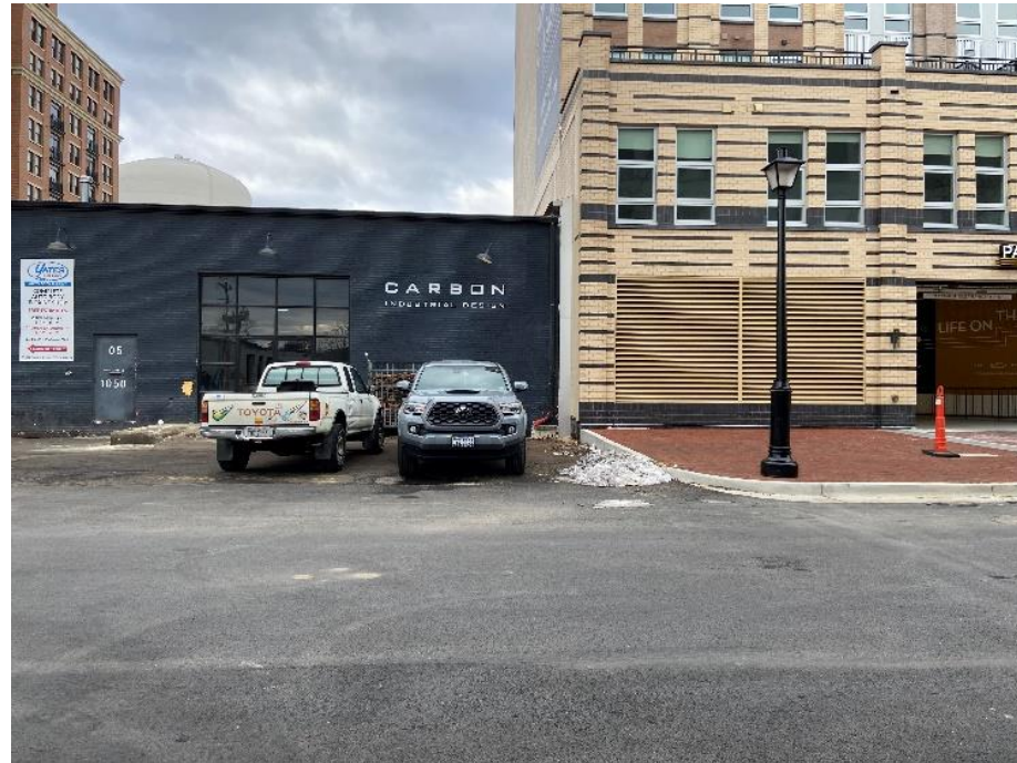
1050 N. Fayette adjacent to The Platform