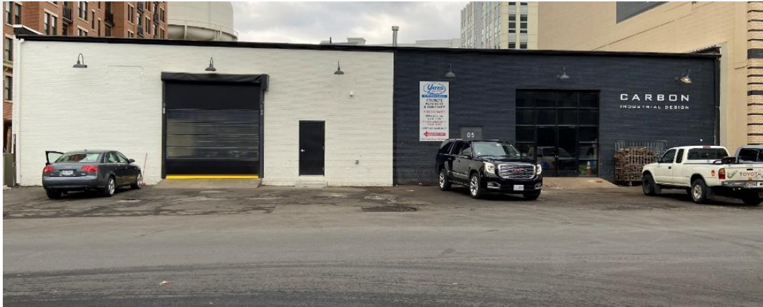
1050 N. Fayette St.