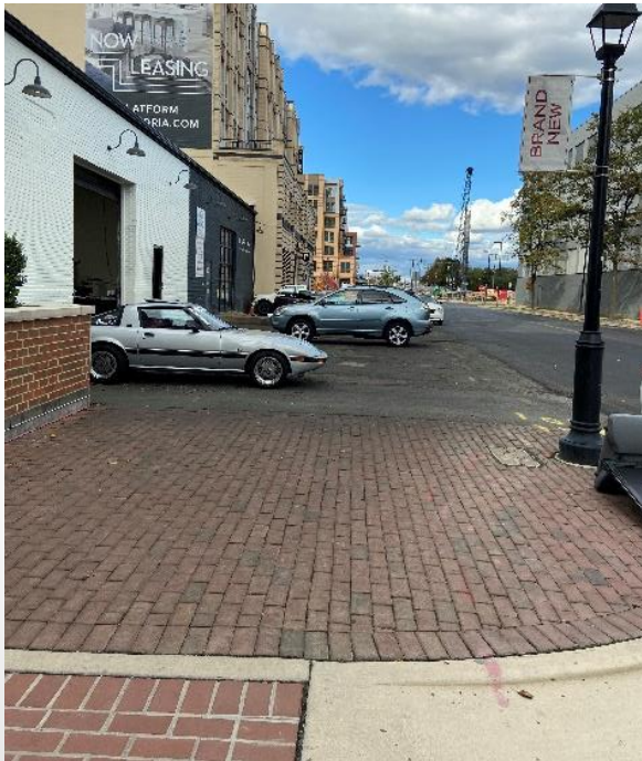
Dalton sidewalk looking N.