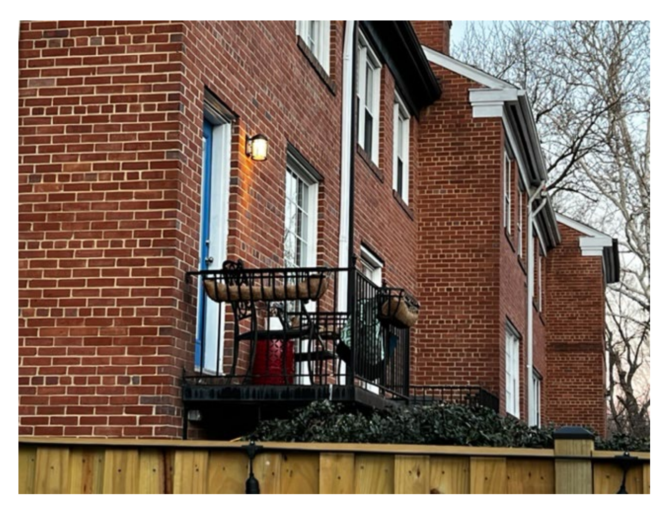
As you can see from the current view from our balcony to 210 Green Street, the 6x6 posts already installed indicate the height of the future deck which will sit well above the current fence.