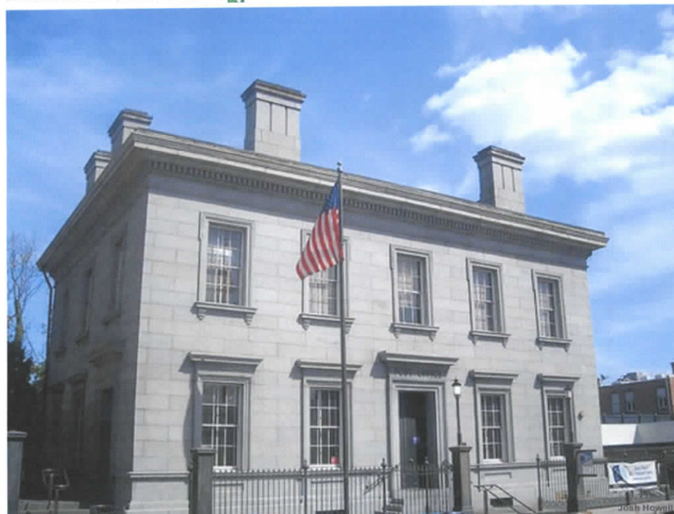
Georgetown post office on 31st Street.