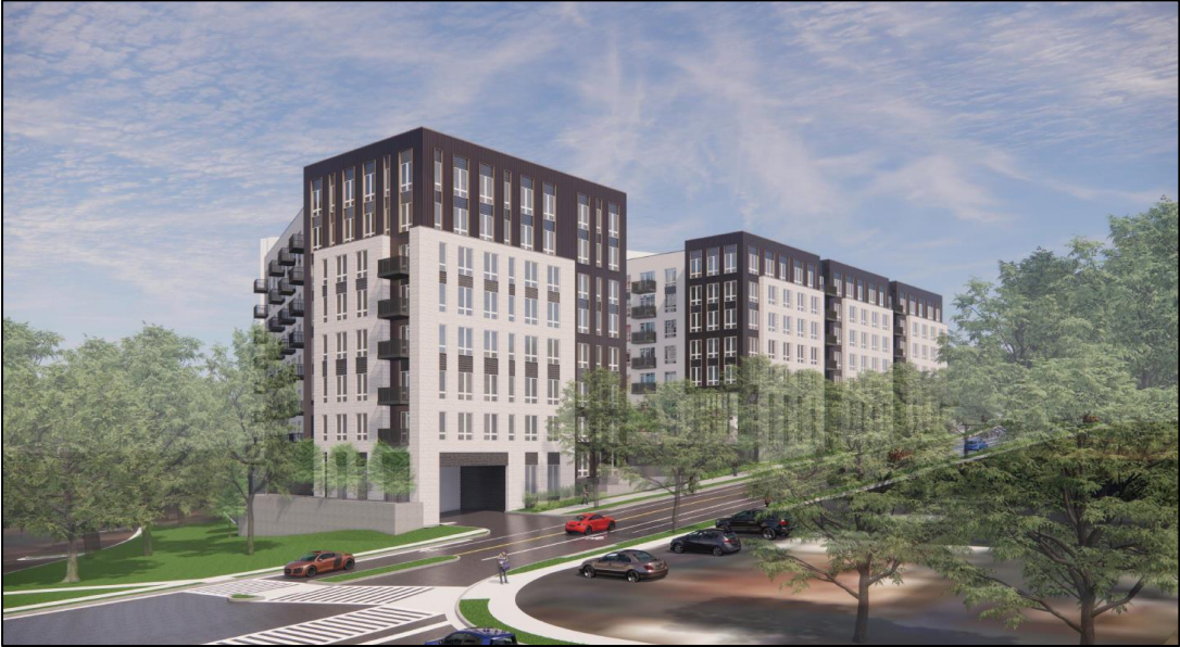
View from Yoakum Pkwy