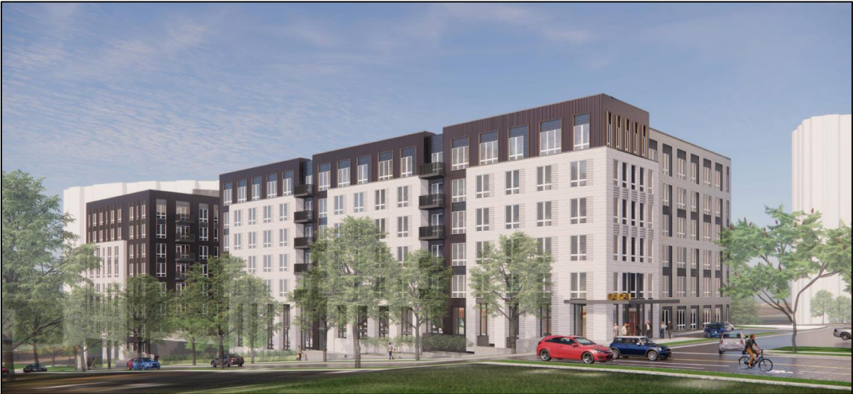
View from S. Whiting St