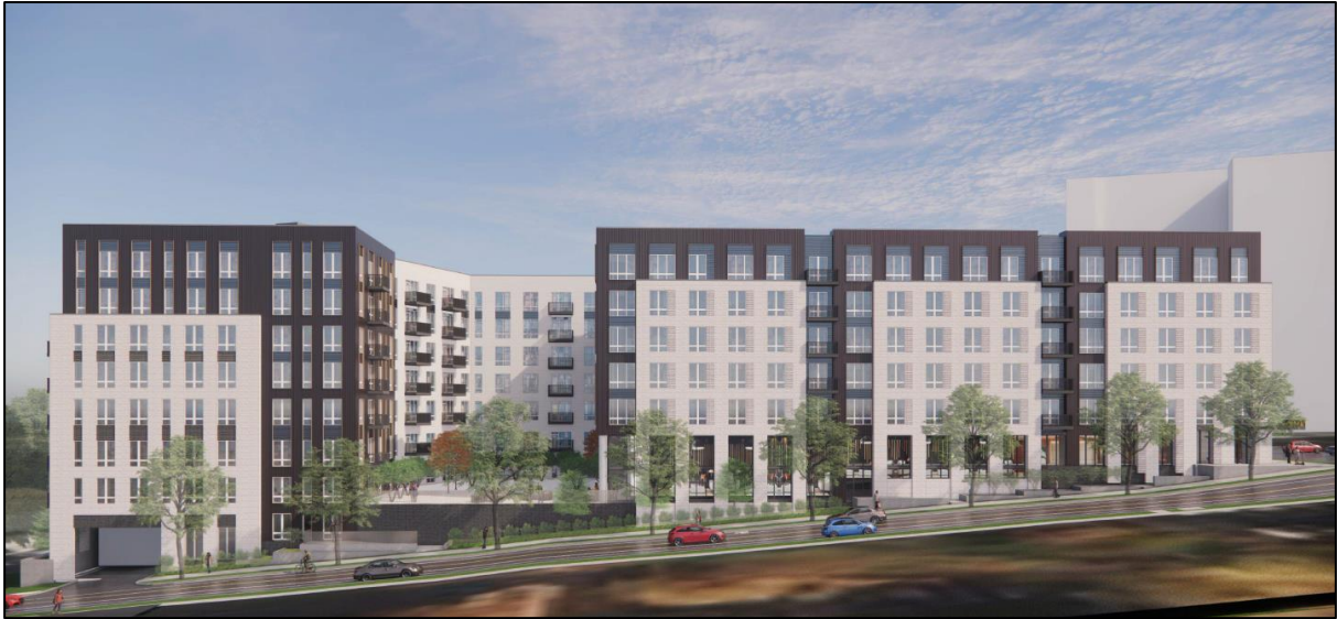
View from Stevenson Ave