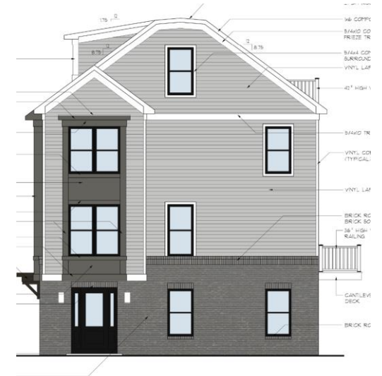
RIGHT-SIDE ELEVATION (UNIT #1)