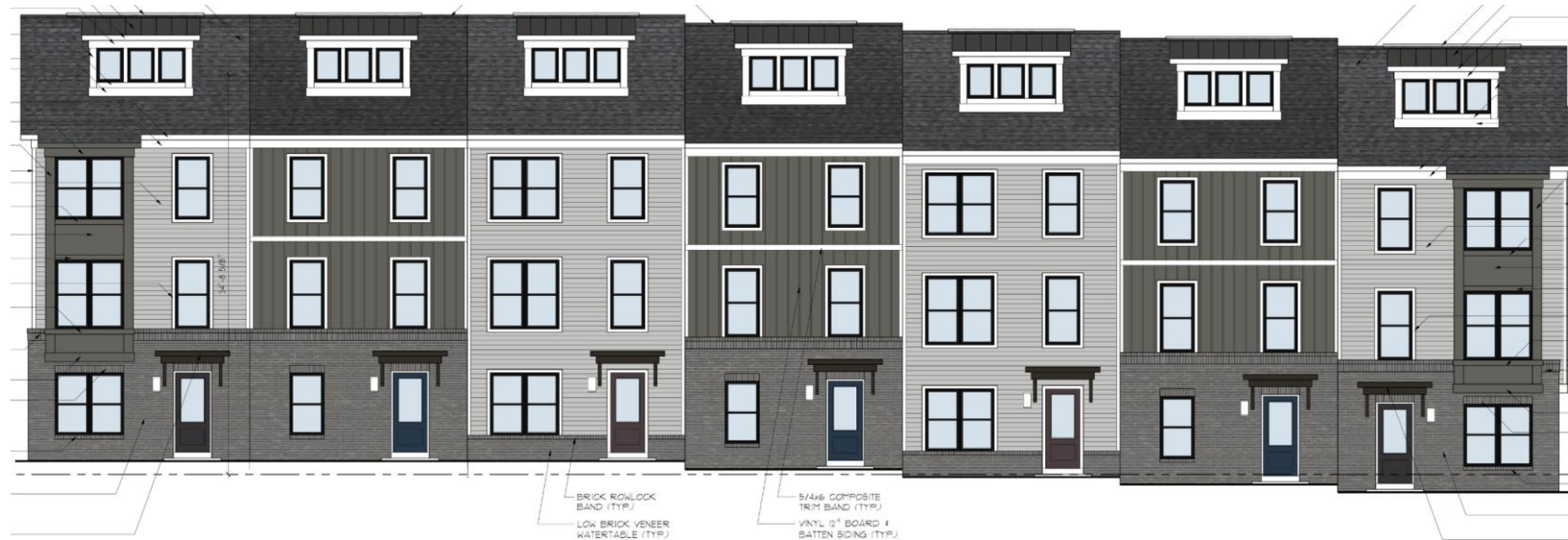
UNIT #7 ELEVATION #3