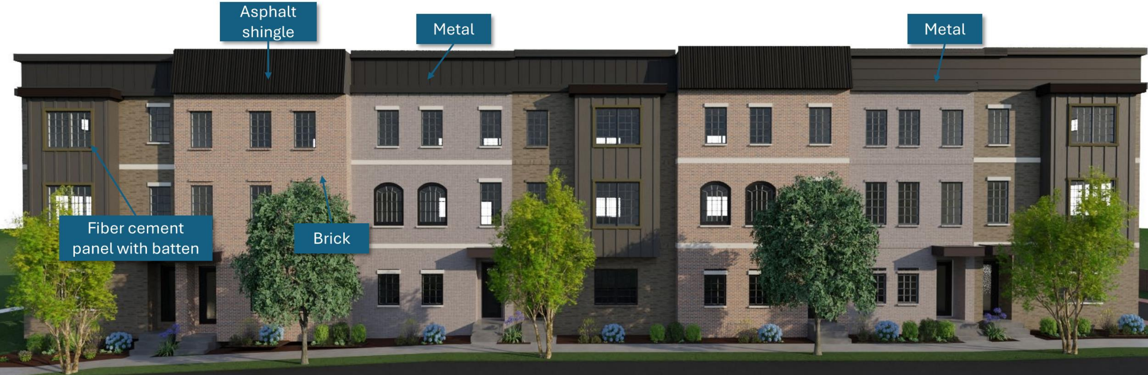
Echols Ave Elevation