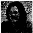
Cyrus Crossan Videographer / Photographer

📞 703-216-9331 🖥️ www.cyruscrossan.com ✉️ cyrus.crossan@gmail.com