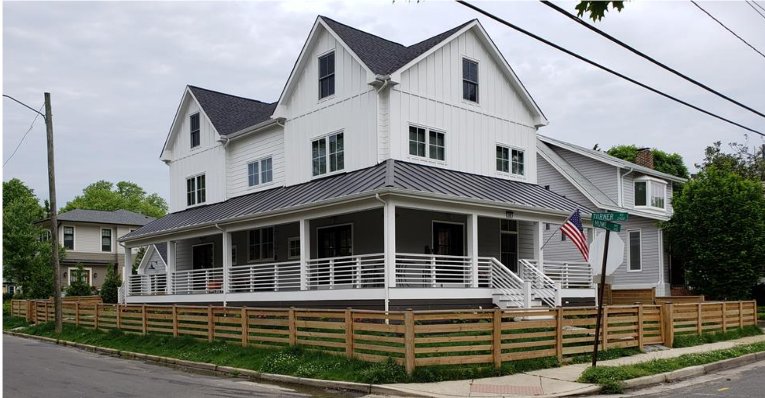
Northeast Facing Elevation

Encroachment into the public rights-of-way along Hume Avenue and Turner Road for a fence