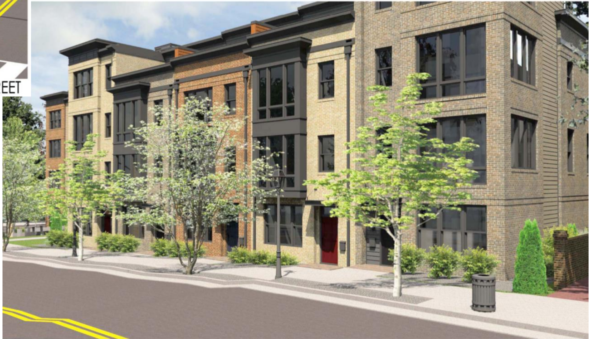
VIEW C - LOOKING NORTHEAST FROM SOUTH ALFRED STREET