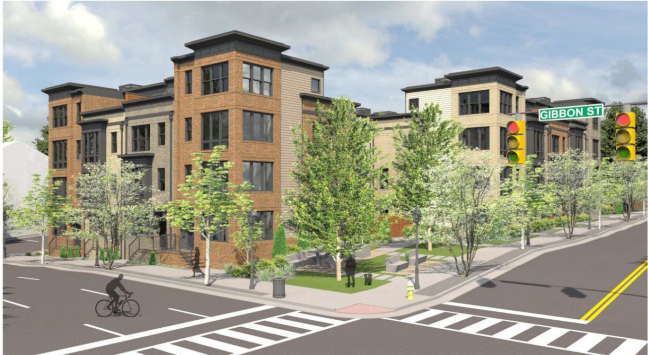
VIEW A - LOOKING SOUTHEAST AT THE INTERSECTION OF GIBBON STREET AND SOUTH ALFRED STREET