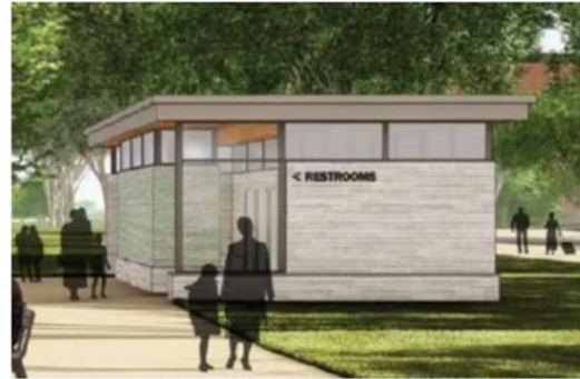
CONCEPTUAL POTENTIAL REPLACEMENT (Example rendering for NAMA public restrooms project)