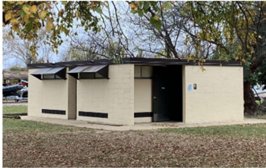
EXISTING COMFORT STATION

GWMP WASHINGTON SAILING MARINA – COMFORT STATION PMIS 319609