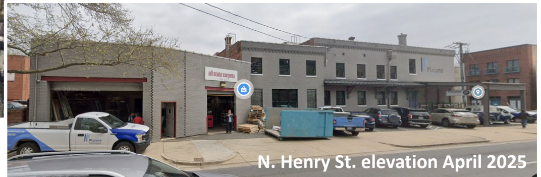
N. Henry St. elevation April 2025