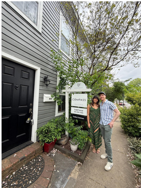
Signing Day, April 25, 2025