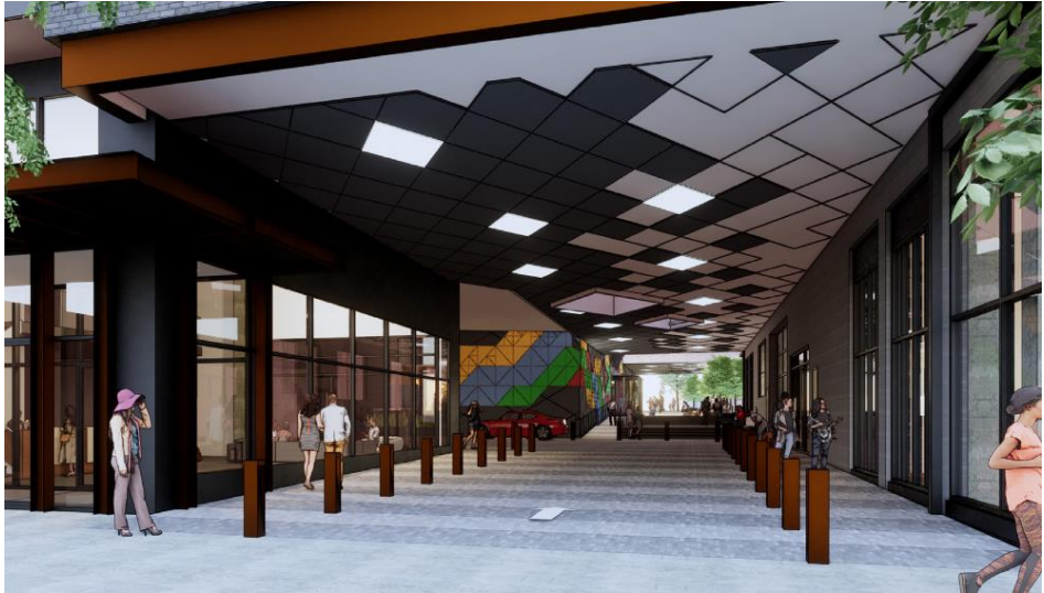
Paseo entrance from Madison Street