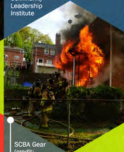
SCBA Gear