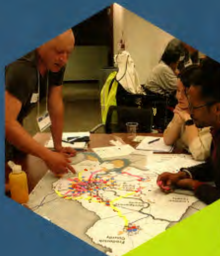
Community Leadership Institute