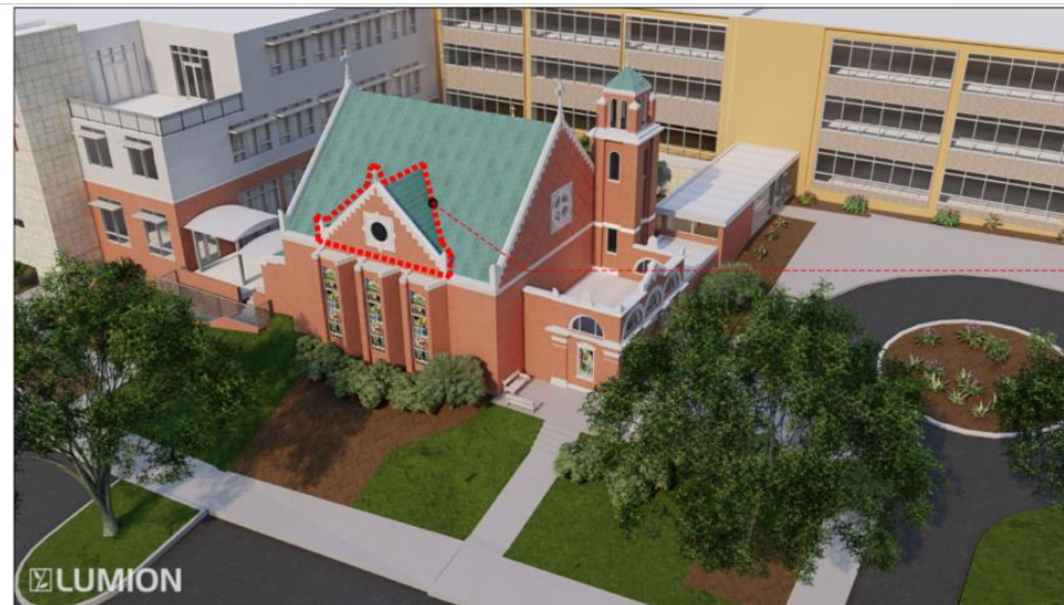
1 AERIAL VIEW LOOKING NORTH WEST 3d-1 NTS