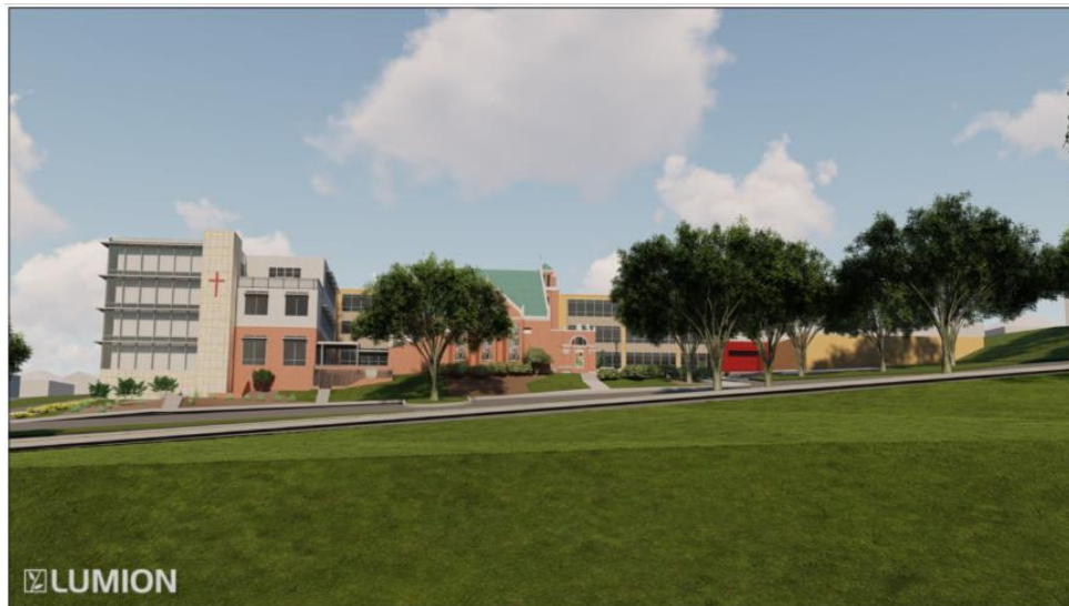
1 VIEW FROM DUKE STREET LOOKING NORTH 3d-1 NTS