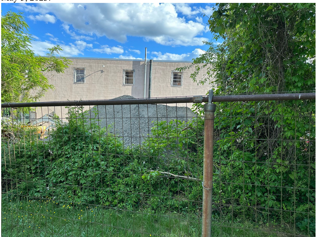
May 2, 2024: