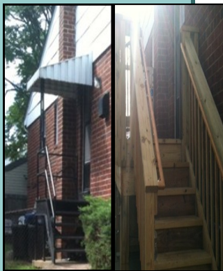
A Before and After RAMP Renovation