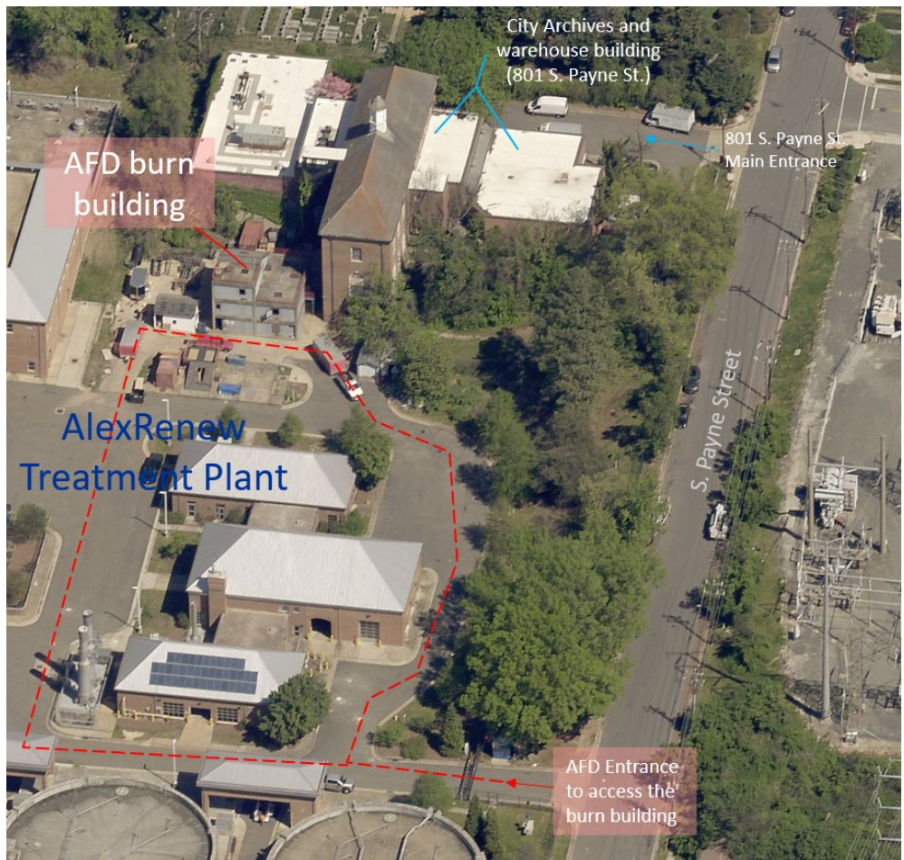
Graphic 1: The AFD burn building site and access.

Instead, the Fire Department has an agreement with the neighboring AlexRenew property to access the burn building through a gated access point off S. Payne Street south of the subject parcel, going through the AlexRenew property, as seen in the Graphic shown here.