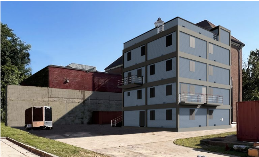
Graphic 2: SW view of proposed burn building and new retaining wall.