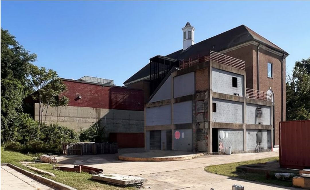
Graphic 1: SW view of existing burn building.