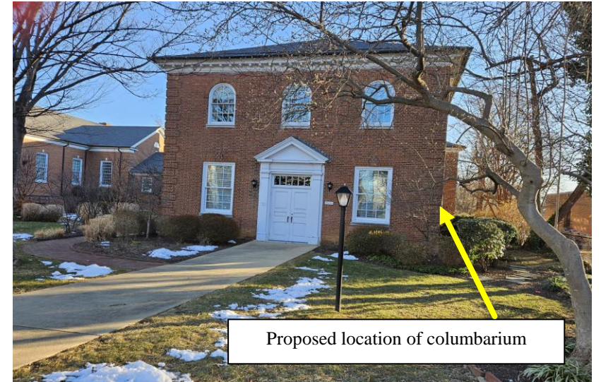
Figure 2: View of chapel entrance