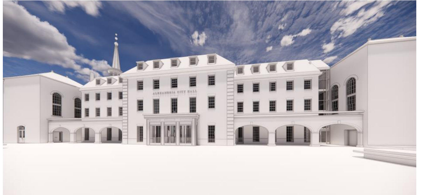
Rendering of proposed City Hall, as seen from Market Square (looking North)