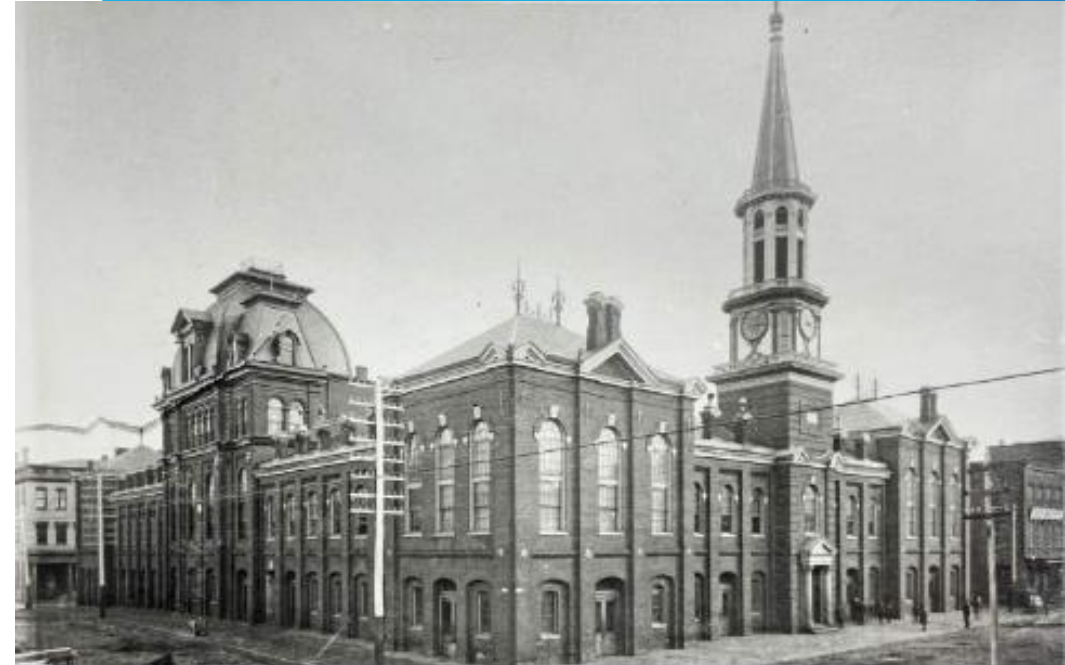
Picture: City Hall C. 1890 at intersection of N. Royal St. and Cameron St.