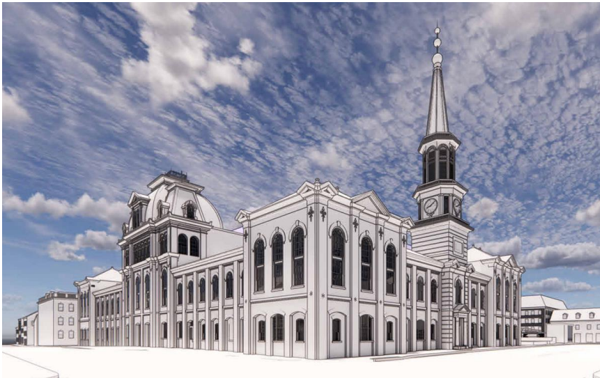
Rendering of Renovated City Hall, as seen from N. Royal St. & Cameron St.