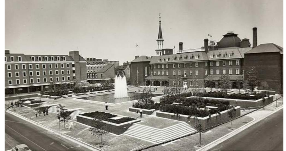
Picture: June 1967 newly completed Market Square