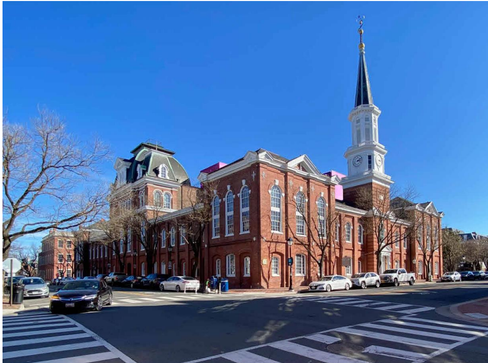
Picture: Current City Hall, as seen from N. Royal St. & Cameron St.

1871 Original City Hall building to be preserved.