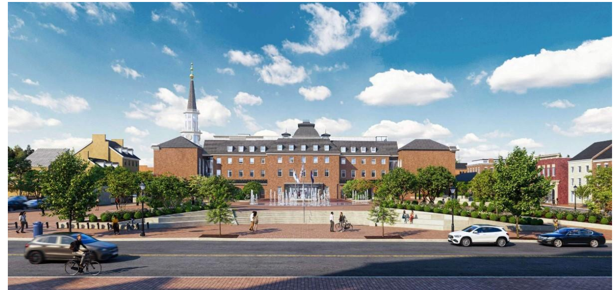
Rendering of Proposed Market Square