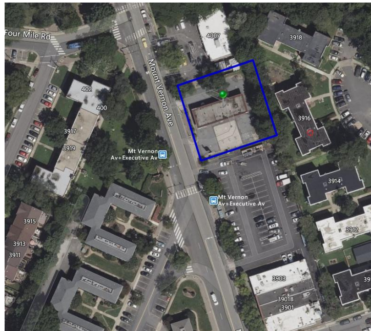
Figure 2: Site Context

The property is surrounded by a mix of commercial and residential uses. The 24 Express convenience store is located immediately to the north. A surface parking lot, a building with a Tiger Mart and bakery and other retail uses, and the Mount Vernon Village Center are located to the south. Residential apartments are located to the east on Bruce Street and to the west in the Presidential Greens residential complex (Figure 2).