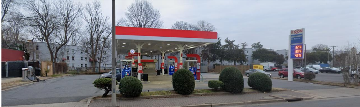
Figure 1: Front of business at 4001 Mount Vernon Avenue

The subject property is one lot of record with 132 feet of frontage along Mount Vernon Avenue, a depth of 130 feet, and a lot area of approximately 17,000 square feet. The lot is developed with a 120-square foot kiosk and canopy covering gasoline pump islands. There are no repair bays at this location (Figure 1).