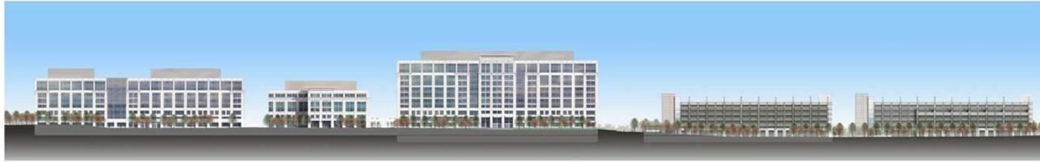
EISENHOWER AVENUE ELEVATION