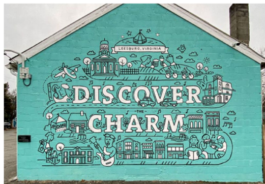
Example of a mural with text exceeding the sign area allowance but complies with the administrative SUP limitations