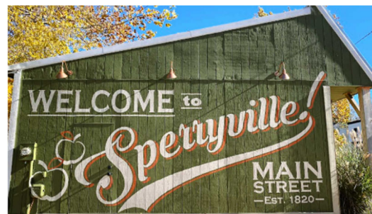
Examples of murals with text exceeding the sign area allowance for an administrative SUP, requiring City Council review