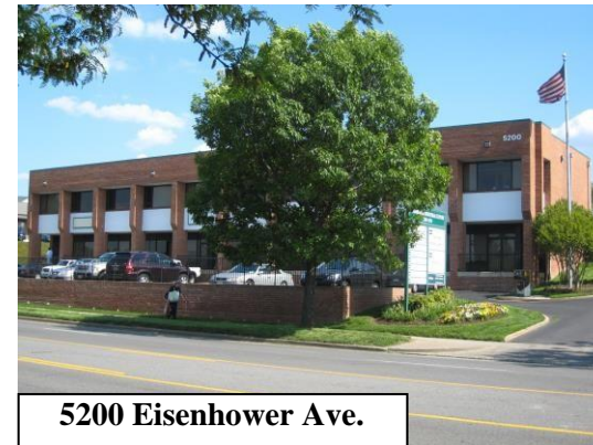
5200 Eisenhower Ave.