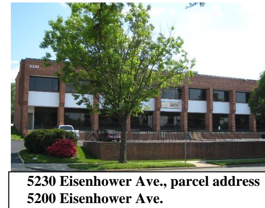
5230 Eisenhower Ave., parcel address 5200 Eisenhower Ave.