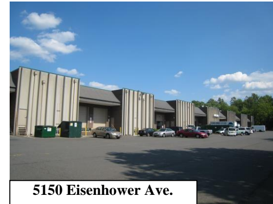
5150 Eisenhower Ave.