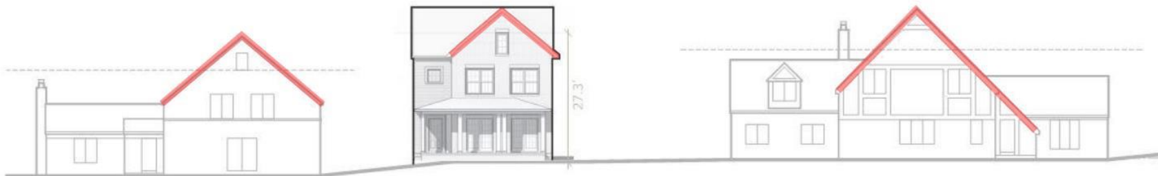
3107 CIRCLE HILL ROAD